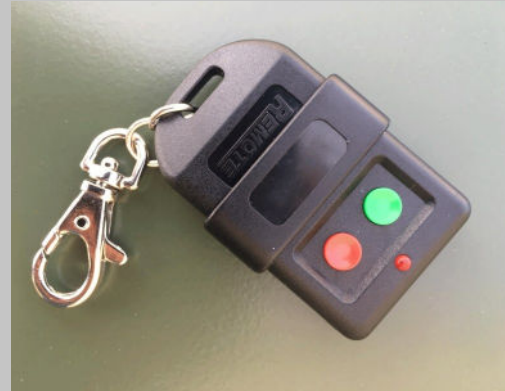
Wired and Wireless Remote Switches