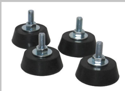
Rubber Isolation Mounting Feet