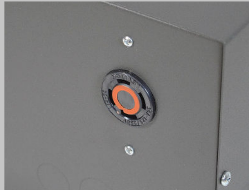
Twist-Lock Outlets and Plugs