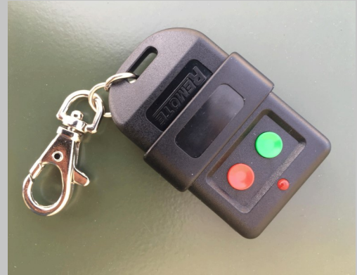
Wired and Wireless Remote Switches