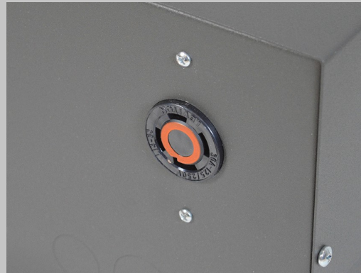
Twist-Lock Outlets and Plugs