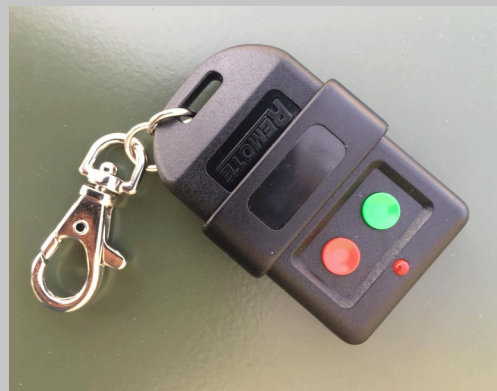
Wired and Wireless Remote Switches