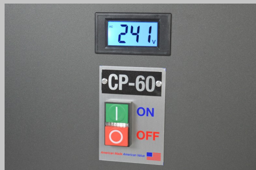
Digital Voltage Meter