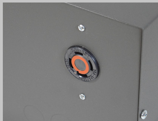
Twist-Lock Outlets and Plugs