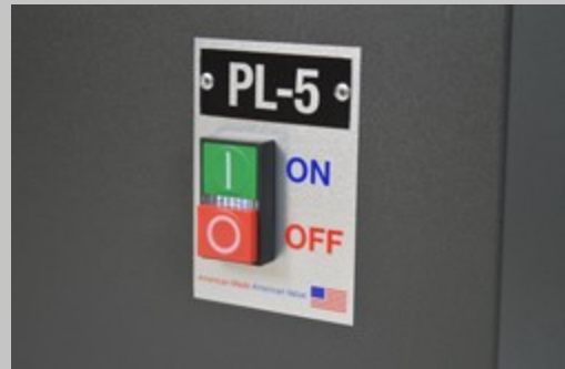
Built-In Motor Stater with Start / Stop Switch