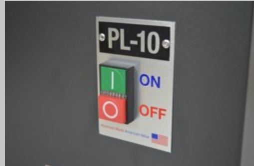
Built-In Motor Starter with Start / Stop Switch