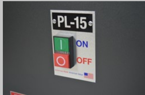
Built-In Motor Stater with Start / Stop Switch