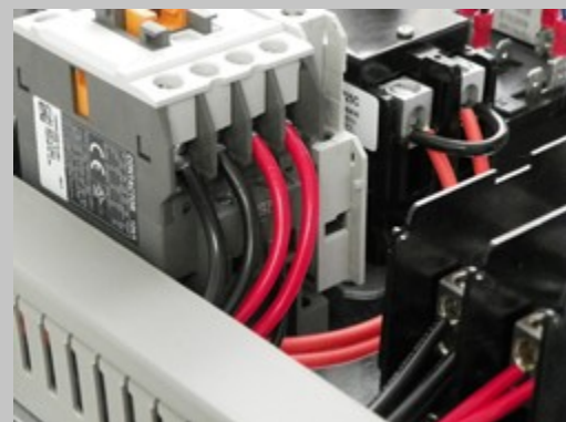
Complete 3 Phase Power Guard Protection