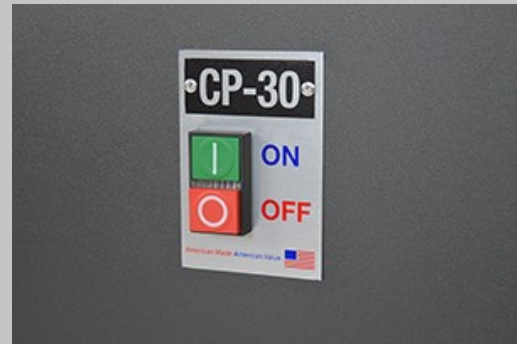
Built-In Motor Starter with Start / Stop Switch